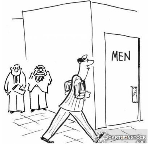
"I admire the confident stride of a man who knows where he is going."

Winter Night Shelter – "Lord, when did I find you homeless and give you shelter?" Thank you to all those involved in delivering the first half of the project from early December through to now. It has been a great effort and our centre has been very popular with the guests. If you would like to know more about the Winter Night Shelter please contact me on speople@btinternet.com or 01827 825403.